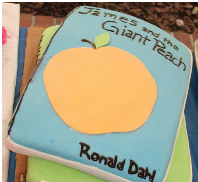
James & the Giant Peach and Matilda Unknown