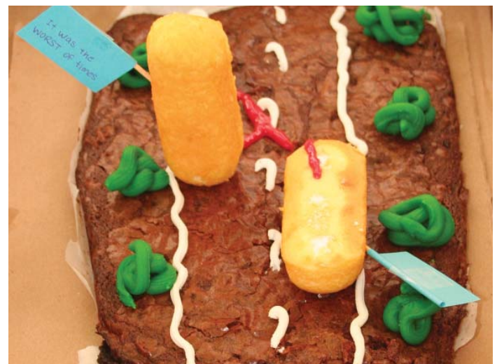
The Tale of Two Twinkies (Cities) Adrian Zeck