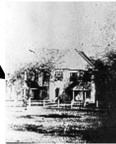
Alachua County Courthouse 1857-1884