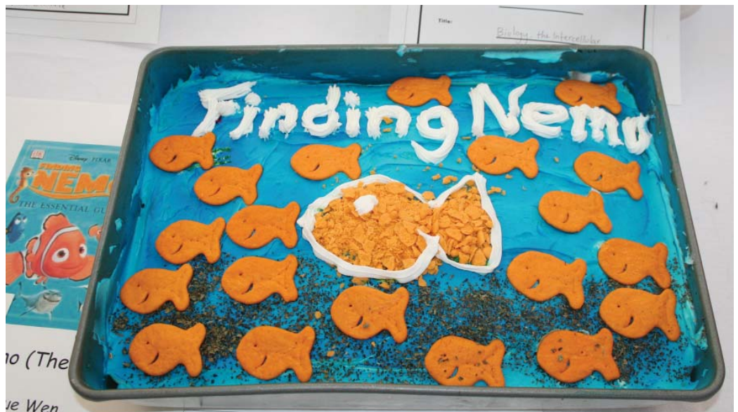
Sue Wen Finding Nemo Walt Disney & Pixar