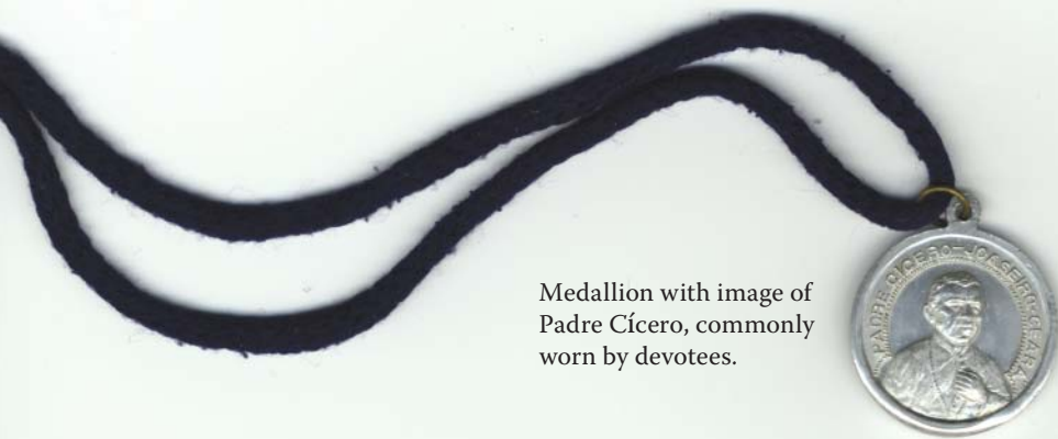
Medallion with image of Padre Cícero, commonly worn by devotees.

Sponsored by the University of Florida George A. Smathers Libraries, the Howe Society, the UF Center for Latin American Studies, and the UF Department of Religion