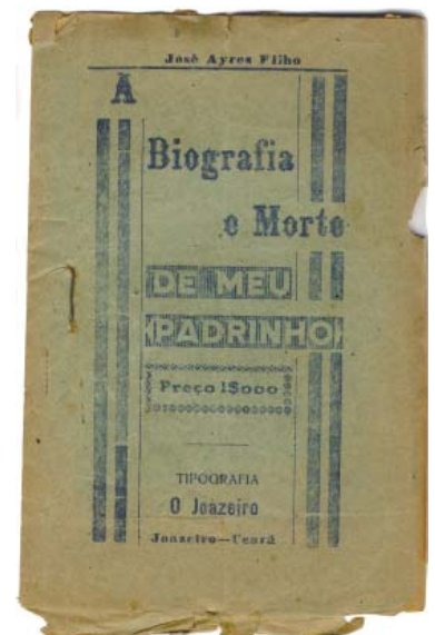
"A biografia e morte de meu Padrinho" (author, José Ayres Fliho; 1934). Written just after death of Padre Cícero; very rare & very fragile.

"Album histórico do Seminário Episcopal do Crato" – Rio de Janeiro; 1925. 243 p. Similar to the item above, but applicable to the city of Crato, Juazeiro do Norte's historic political and economic rival.