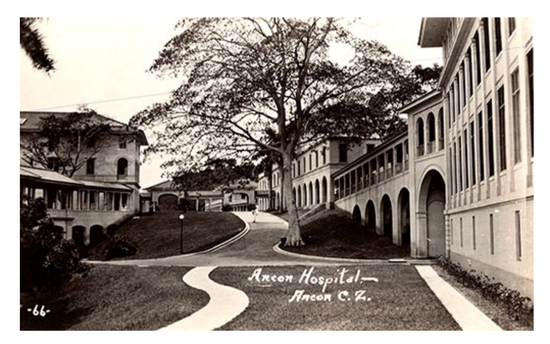
Ancon Hospital, Ancon, C.Z.

We received questions from a wide variety of people, including K-12 students, college students, and faculty and scholars. We also received many requests from people who lived in the Canal Zone or from family members researching their relatives who worked on the Canal. We actually do not have a lot of resources to assist genealogists because records for employment, service, etc., are maintained by the Federal government. However, we do have yearbooks, newspapers, and other publications that are occasionally useful. We also received research queries from archivists, librarians, and museum professionals who are researching topics for possible exhibitions at their libraries or museums.