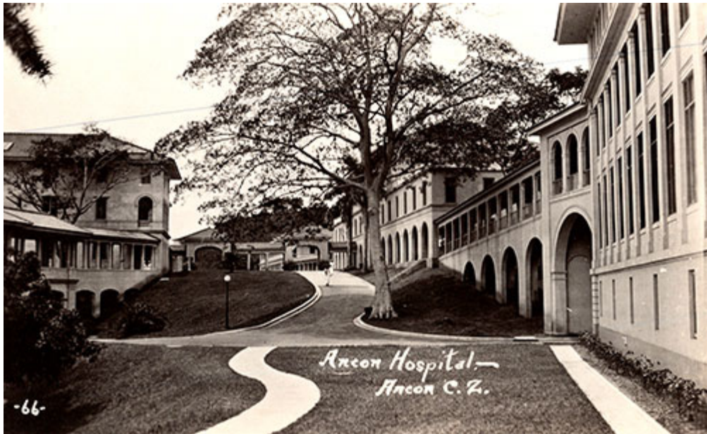
Ancon Hospital, Ancon, C.Z.

We received questions from a wide variety of people, including K-12 students, college students, and faculty and scholars. We also received many requests from people who lived in the Canal Zone or from family members researching their relatives who worked on the Canal. We actually do not have a lot of resources to assist genealogists because records for employment, service, etc., are maintained by the Federal government. However, we do have yearbooks, newspapers, and other publications that are occasionally useful. We also received research queries from archivists, librarians, and museum professionals who are researching topics for possible exhibitions at their libraries or museums.