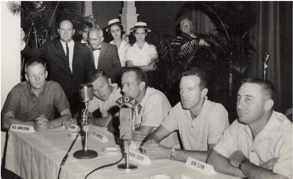
With NASA Astronauts Neil Armstrong, Gus Grissom, Scott Carpenter, Gordon Cooper and John Glenn.