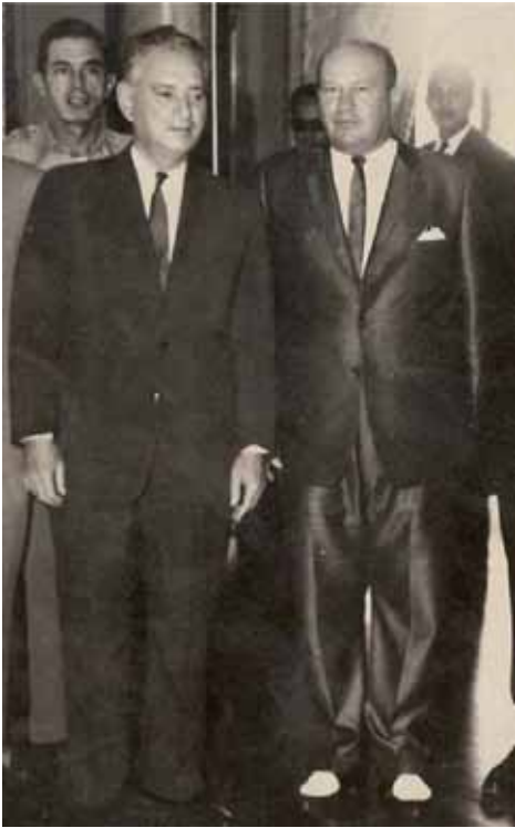
With Panama President Marco Robles.