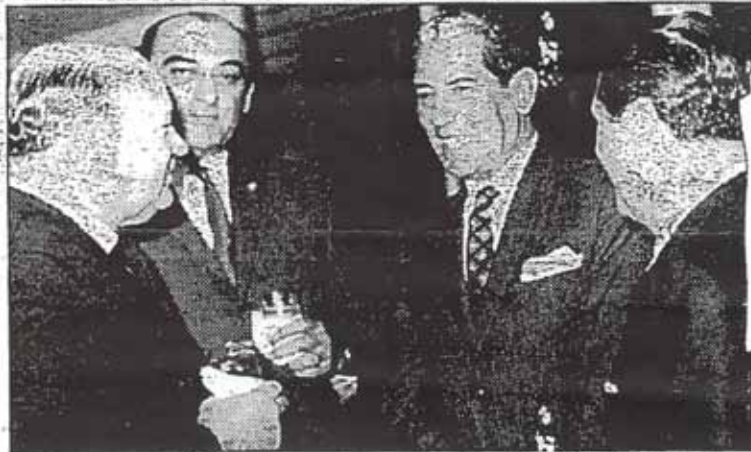
Los coroneles antes de dar el gorilazo contra el Dr. Arnulfo Arias.

Note: Arnulfo Arias was overthrown for the third (and last) time on October 11, 1968