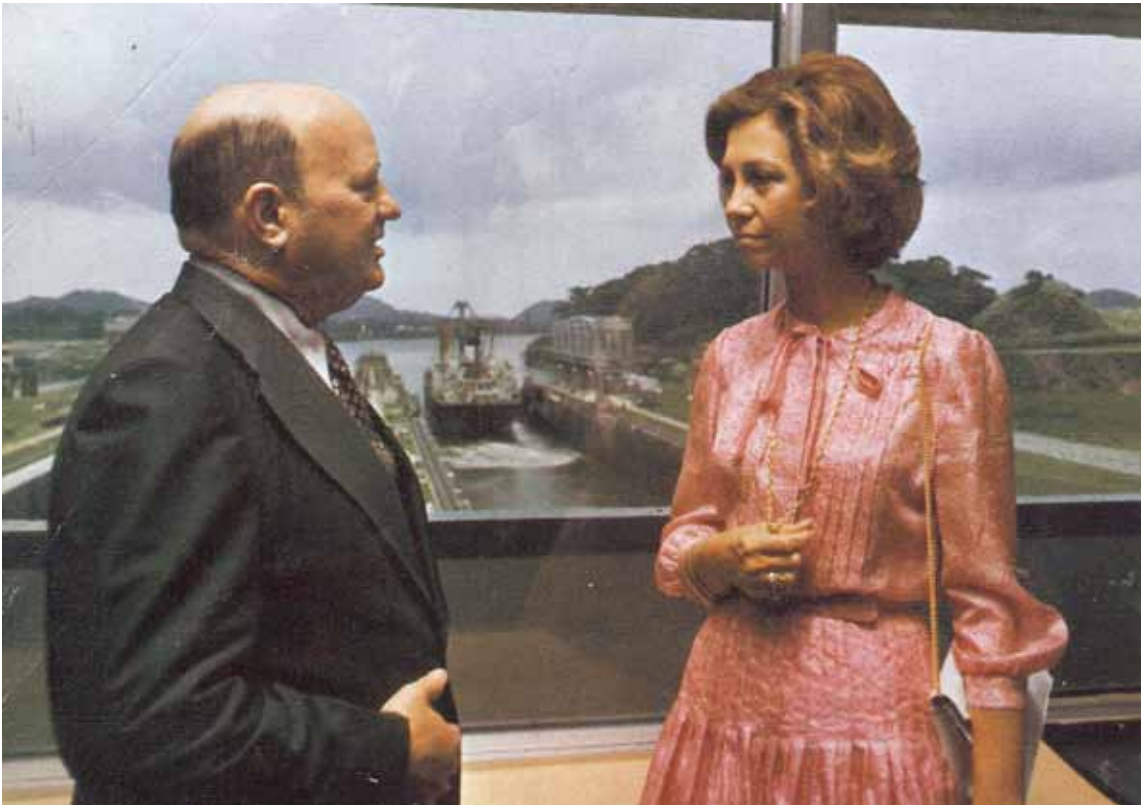
With Queen Sofia of Spain